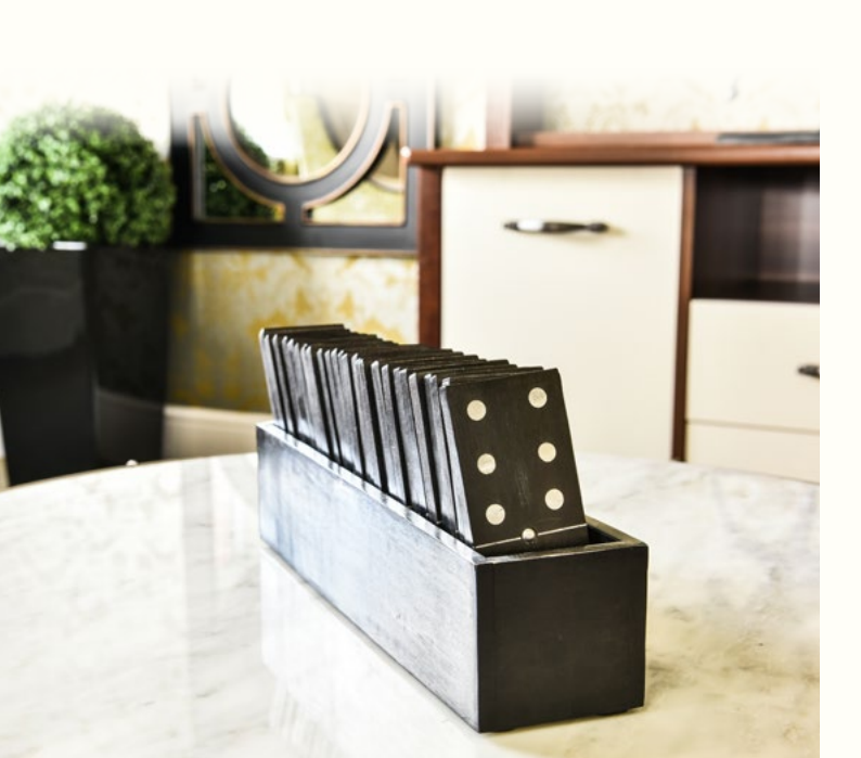
Enjoy a game of dominoes with friends.