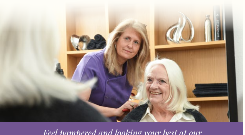
Feel pampered and looking your best at our hairdressing salon.

Whilst your room comes fitted with everything you need, you are very welcome to bring your own furniture as well. The room is fully set up should you wish to have your own subscription to Sky, all you need to do is arrange your package and box with them.