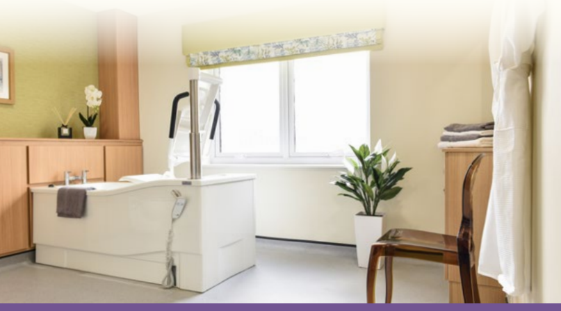
Enjoy a relaxing bath in one of our tastefully decorated bathrooms.

Our care team have access to the latest care plan technology and will take time to get to know you, your family and all your favourite things. This helps us to know your desires as well as your needs to make sure your care package is tailored to respond to all health, care and personal needs you may have. It will also help inform us of what to include in our menus, activities programmes and trips out of the home.