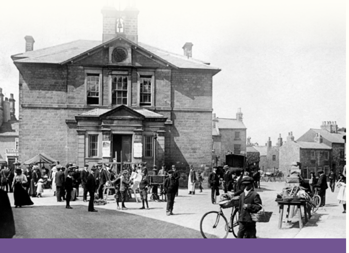
Located in the heart of the community.