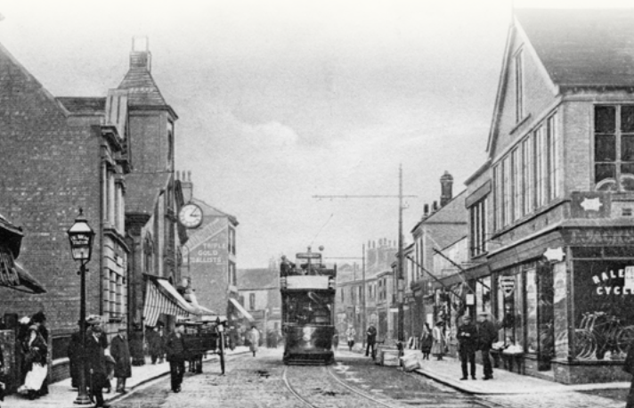
Located in the heart of the community.