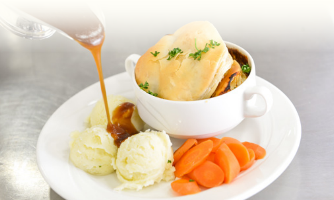
Tuck into a hearty steak pie.

Larkhill Hall's varied menus of healthy meals all have a choice of options at breakfast, lunch and dinner. All food in the home is created using the best locally sourced ingredients and is prepared freshly on-site.