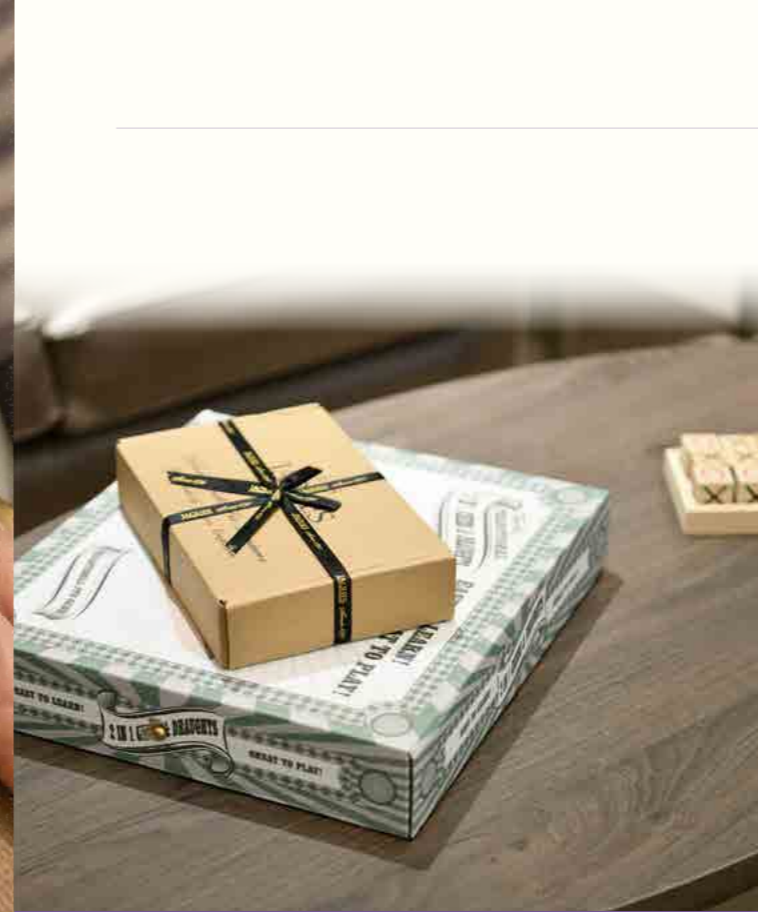
Enjoy a board game with friends.

Handley House's Activity Co-ordinators make sure we have a variety of entertainment and pursuits for you to take part in. We regularly have a larger themed party or event, whether Christmas, Valentine's Day or a garden party. Friends and family are invited to join in.