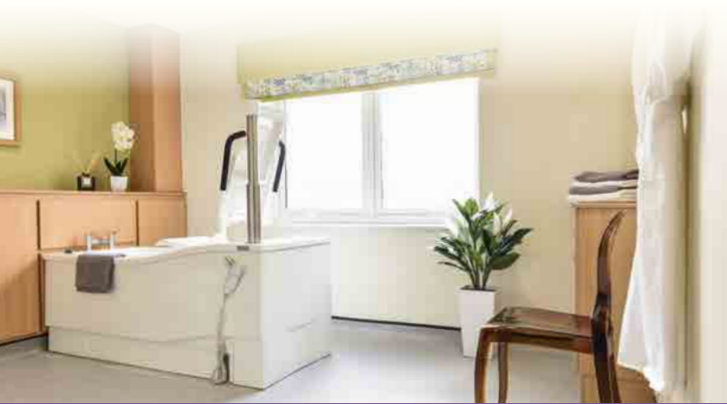
Enjoy a relaxing bath in one of our tastefully decorated bathrooms.

The design of our buildings and extensive training incorporate best practice care to make sure our residents feel calm and content. We are like one big family and our residents quickly make lasting friendships with our care team as well as fellow residents.