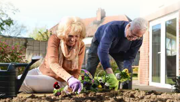
Help plant vegetables or enjoy the morning paper in the sun.