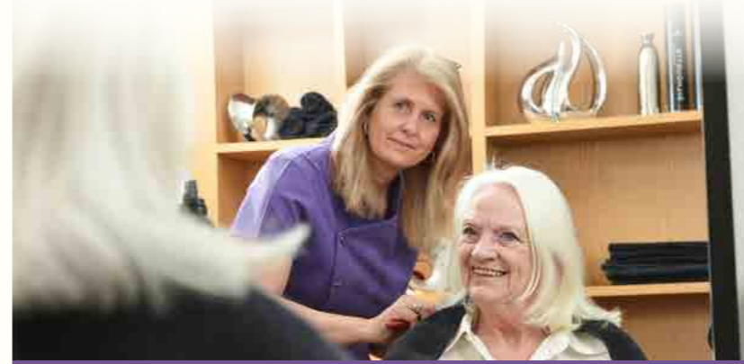
Feel pampered and looking your best at our hairdressing salon.

Handley House's landscaped sensory gardens have raised flower beds which green-fingered residents can enjoy pottering in during the summer months.