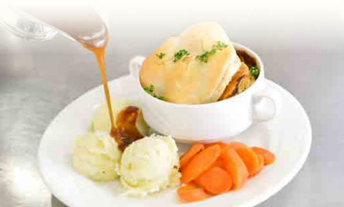
Tuck into a hearty steak pie.

Handley House's varied menus of healthy meals all have a choice of options at breakfast, lunch and dinner. All food in the home is created using the best locally sourced ingredients and is prepared freshly on-site.