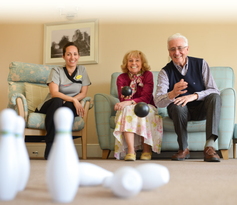
Have a game of carpet bowls with friends.

Activities encourage fullness of life, day to day enjoyment and fun. Each day, there is a full timetable of activities available in the home as well as many recreational resources you can access yourself at any time. If you want to kick-back and watch TV, that's fine too – this is your home to enjoy as many or few of the activities on offer as you wish.