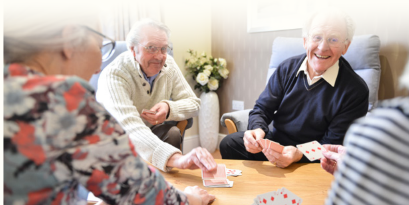
Keep active with armchair exercises, show your creative side making bird boxes or have a giggle with friends over afternoon tea, there is lots to do at Hambleton Grange.

Hambleton Grange is an important part of the local community in Thirsk and we often have visitors to the home to deliver talks, perform or join us for a coffee morning.