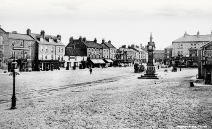
Located in the heart of the community.