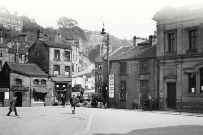
Located in the heart of the community.