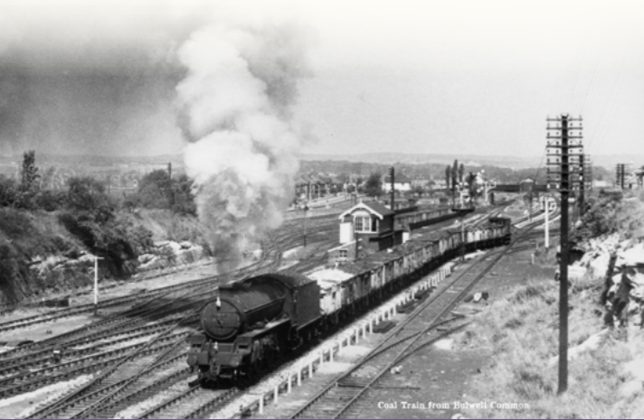
Coal Train from Bishopton, Co. Down