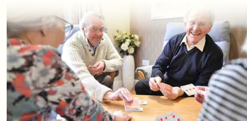
Keep active with armchair exercises, show your creative side making bird boxes or have a giggle with friends over afternoon tea, there is lots to do at Fairway View.

Fairway View is an important part of the local community in Bulwell and we often have visitors to the home to deliver talks, perform or join us for a coffee morning.