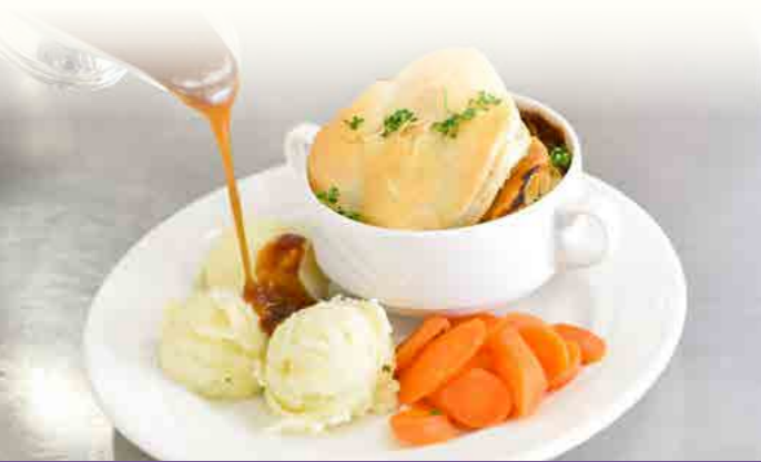
Tuck into a hearty steak pie.

Fairway View's varied menus of healthy meals all have a choice of options at breakfast, lunch and dinner. All food in the home is created using the best locally sourced ingredients and is prepared freshly on-site.