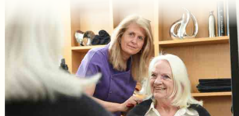
Feel pampered and looking your best at our hairdressing salon.

Whilst your room comes fitted with everything you need, you are very welcome to bring your own furniture as well. The room is fully set up should you wish to have your own subscription to Sky, all you need to do is arrange your package and box with them.