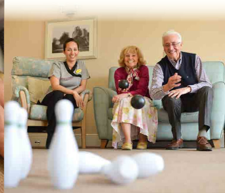
Have a game of carpet bowls with friends.

Activities encourage fullness of life, day to day enjoyment and fun. Each day, there is a full timetable of activities available in the home as well as many recreational resources you can access yourself at any time. If you want to kick-back and watch TV, that's fine too - this is your home to enjoy as many or few of the activities on offer as you wish.