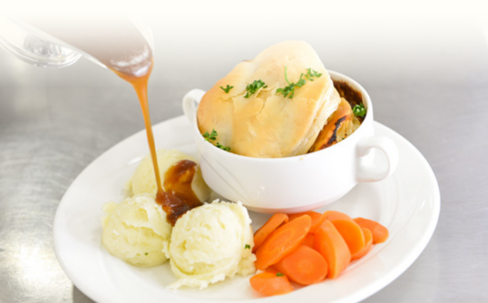
Tuck into a hearty steak pie.

Ebor Court's varied menus of healthy meals all have a choice of options at breakfast, lunch and dinner. All food in the home is created using the best locally sourced ingredients and is prepared freshly on-site.