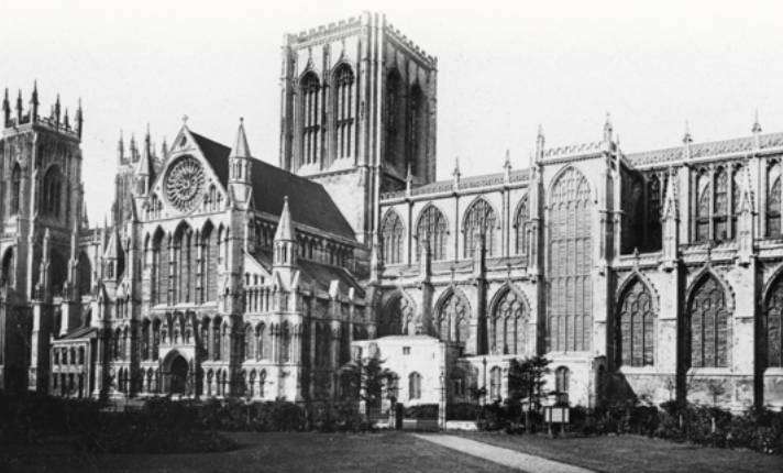
Located in the heart of the community.