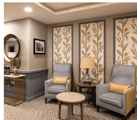
Home from home

Residents must be in need of care and support and be compatible with the social environment. The Manager or a Senior Nurse will be pleased to carry out a pre-move assessment in the person's home or hospital.