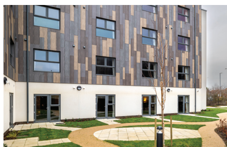
Outdoor garden space to enjoy

Computerised care plans are compiled for residents covering all aspects of daily living and include risk assessments whenever possible. To develop and plan a fulfilling care experience the input of the family and wider group of friends is paramount. They can assist with providing detailed information of the resident's life to date, influences, aspirations, fears and challenges. This sharing of information builds relationships between all parties.