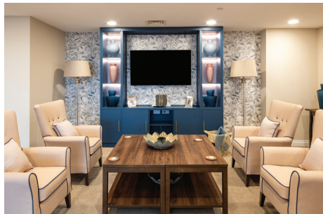
Comfortable social areas

Residents can enjoy a communal lounge and dining area. Meals are served in the dining room or residents can elect to have their meals delivered to their suite. Traditional home cooked food is offered using seasonal produce wherever