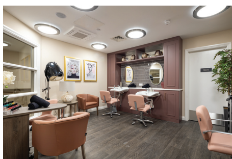
Your own hair salon

There is a full and varied activities programme open to all residents. The social co-ordinators organise an active programme of crafts, games and hobbies as well as regular social events and visiting entertainers. All residents can choose the activities they wish to join.