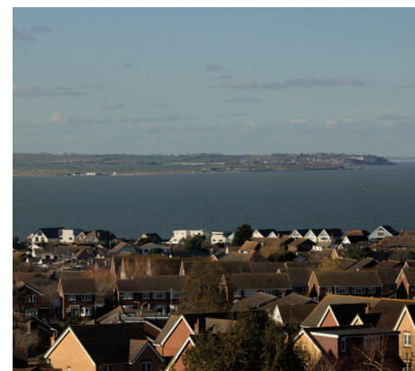
Rooms with views

Full details of all financial and legal matters are available from the Manager or can be viewed on-line at www.whitstablehouse.co.uk .