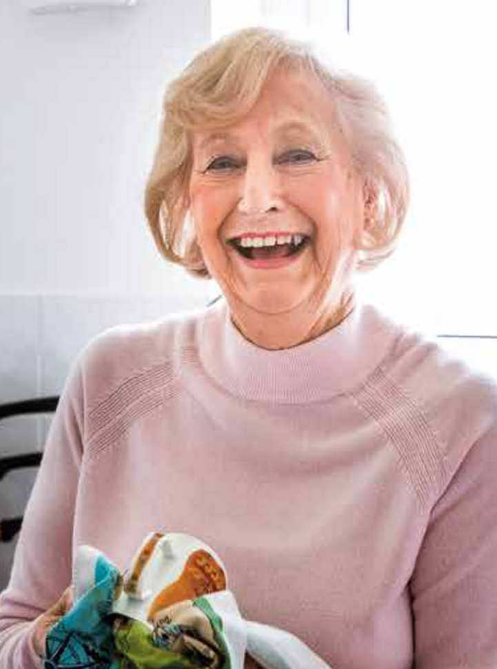
Our Angels are also great company. Because we don't do visits lasting less than an hour, they will always take time to listen and chat, which can really ease loneliness.