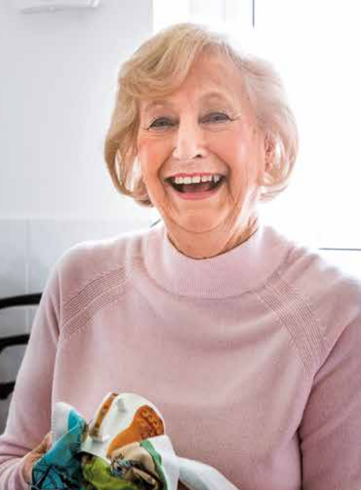
Our Angels are also great company. Because we don't do visits lasting less than an hour, they will always take time to listen and chat, which can really ease loneliness.