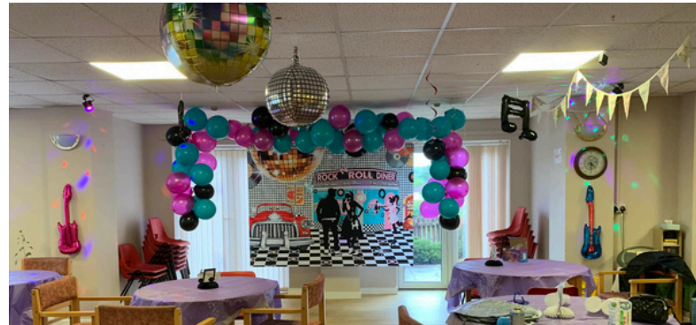
Join us for a rock n' roll musical performance in the lounge

At TÛ Eirin Care Home, our Lifestyle team members work hard to ensure our residents individual needs are met. Uncovering and capturing individual resident hobbies and interests, as well as resident life histories, is an essential element of success in providing personalised daily activities which residents will