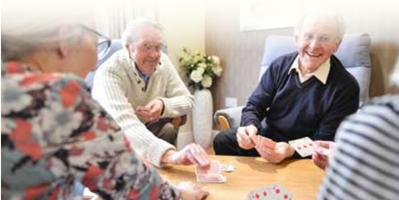
Keep active with armchair exercises, show your creative side making bird boxes or have a giggle with friends over afternoon tea, there is lots to do at Thorn Springs.

Activities encourage fullness of life, day to day enjoyment and fun. Each day, there is a full timetable of activities available in the home as well as many recreational resources you can access yourself at any time. If you want to kick-back and watch TV, that's fine too – this is your home to enjoy as many or few of the activities on offer as you wish.