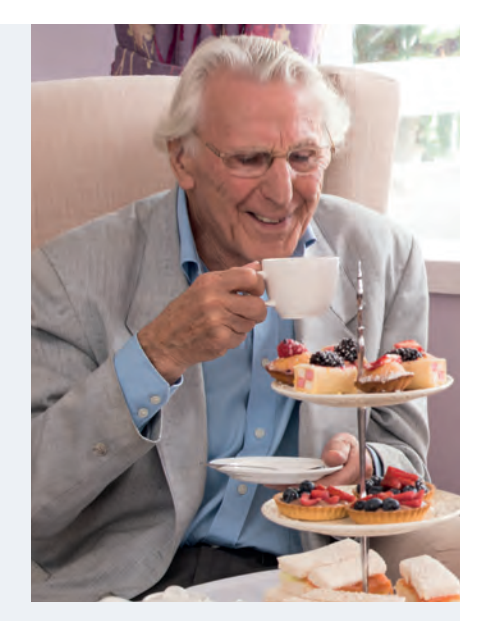
Residents can still do most of their existing hobbies here. They can also suggest something they'd like to try, as a group or in their room.