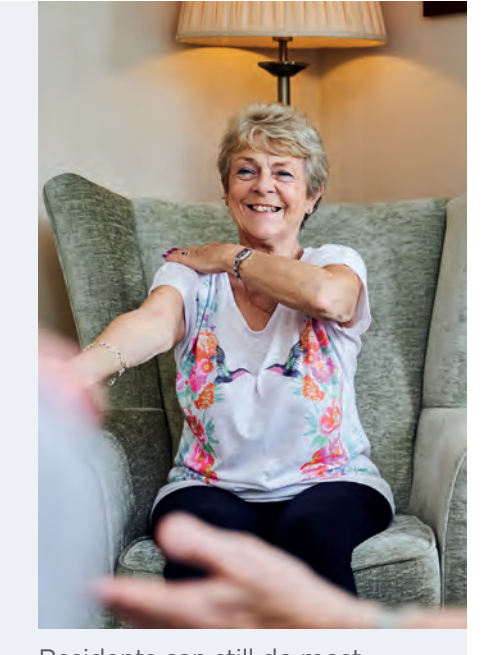
Residents can still do most of their existing hobbies here. They can also suggest something they'd like to try, as a group or in their room.