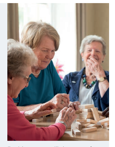
Residents can still do most of their existing hobbies here. They can also suggest something they'd like to try, as a group or in their room.