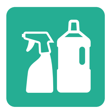
Deep cleaning procedures

The health, safety and well-being of our residents, visitors and care teams is absolutely paramount. We can assure you that we take this responsibility very seriously and implement strict procedures across all of our care homes as standard.