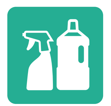
Deep cleaning procedures

The health, safety and well-being of our residents, visitors and care teams is absolutely paramount. We can assure you that we take this responsibility very seriously and implement strict procedures across all of our care homes as standard.