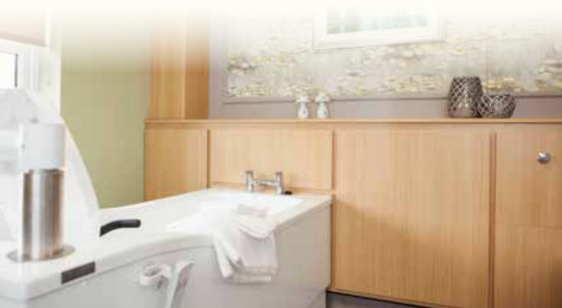
Enjoy a relaxing bath in one of our tastefully decorated bathrooms.

In addition to our high standards of infection control already in place, Ideal Carehomes has successfully launched an initiative called Ideal Fresh Living bringing a new and continued focus on cleaning and sanitisation. We have extra staff allocated to cleaning and infection control including regular deep cleans and frequent sanitising of all surfaces and this is monitored with routine audits carried out by managers. Our modern, purpose-built building provides a perfect environment to implement natural ventilation into daily life, with lots of large social areas to enjoy as well as spacious bedrooms with en-suite facilities to allow plenty of personal space for each resident.