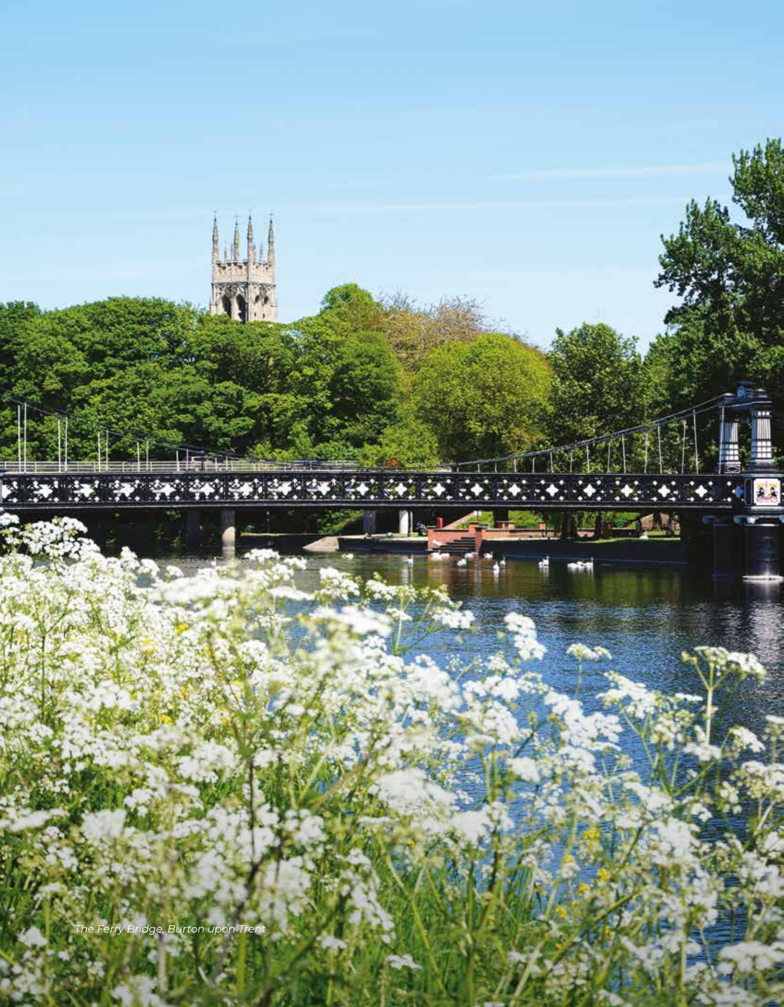
The Ferry Bridge, Burton upon Trent