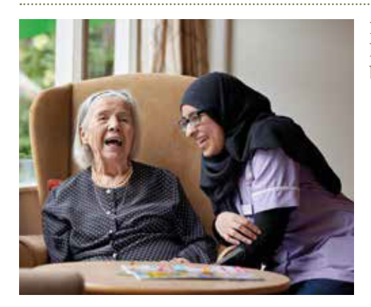
Respite breaks from as little as 1–2 weeks can be arranged.

Short-term care, even for as little as one or two weeks can be used for carers to take a break, a holiday or if they're ill themselves.