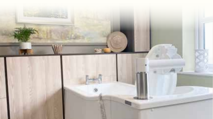
Enjoy a relaxing bath in one of our tastefully decorated bathrooms.

In addition to our high standards of infection control already in place, Ideal Carehomes has successfully launched an initiative called Ideal Fresh Living bringing a new and continued focus on cleaning and sanitisation. Our modern, purpose-built building provides a perfect environment to implement natural ventilation into daily life, with lots of large social areas to enjoy as well as spacious bedrooms with en-suite facilities to allow plenty of personal space for each resident.