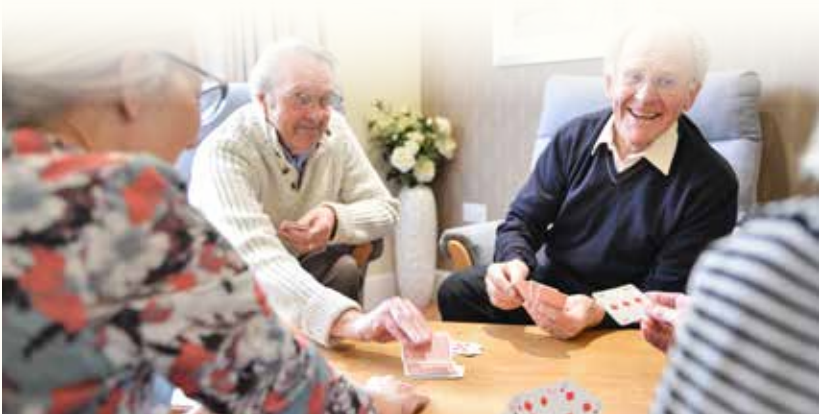
Keep active with armchair exercises, show your creative side making bird boxes or have a giggle with friends over afternoon tea, there is lots to do at Millcroft.

Activities encourage fullness of life, day to day enjoyment and fun. Each day, there is a full timetable of activities available in the home as well as many recreational resources you can access yourself at any time. If you want to kick-back and watch TV, that's fine too – this is your home to enjoy as many or few of the activities on offer as you wish.