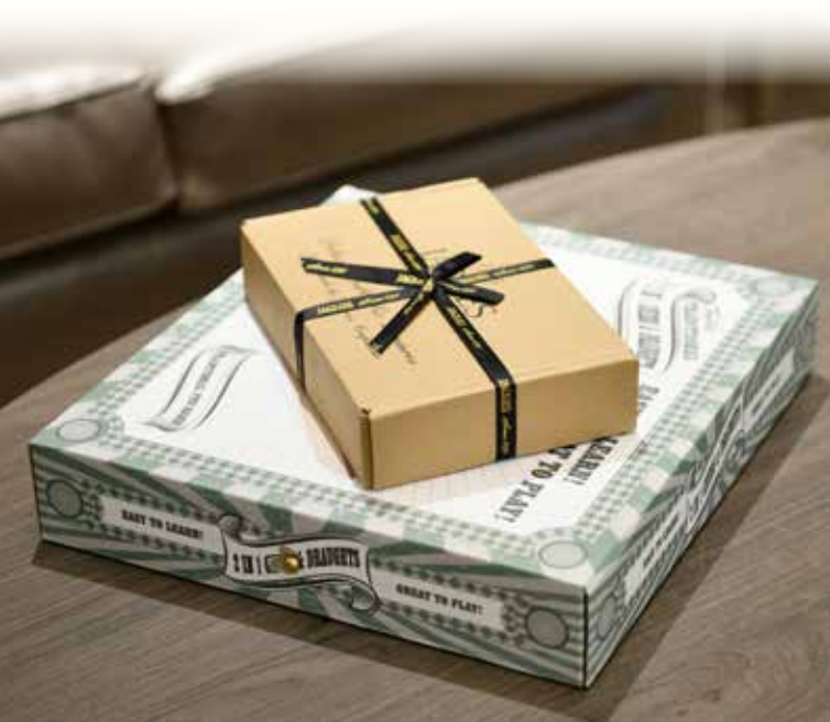
Enjoy a board game with friends.

Maintaining physical activity has lots of benefits for the well-being and independence of residents and we encourage regular light exercise tailored to suit everyone, as well as more leisurely activities such as arts, model making, flower arranging or gardening - our annual 'Gardens in Bloom' competition is enjoyed by everyone!