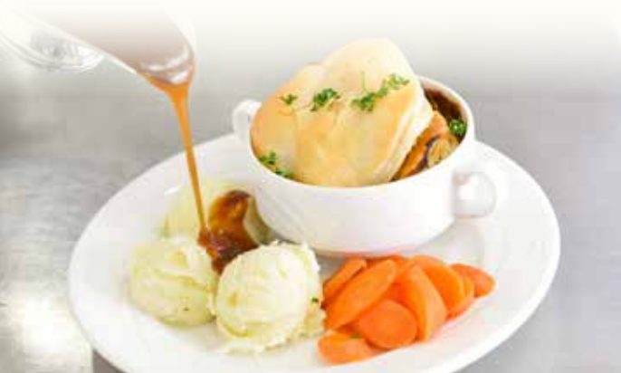
Tuck into a hearty steak pie.

Lime Trees varied menus of healthy meals all have a choice of options at breakfast, lunch and dinner. All food in the home is created using the best locally sourced ingredients and is prepared freshly on-site, and can be enjoyed wherever you prefer - perhaps in the well-appointed dining rooms or tea room with your fellow residents or more private dining, in the comfort of your room whilst catching up with the soaps.