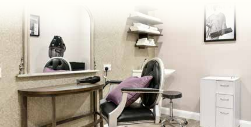
Feel pampered and looking your best at our hairdressing salon.

Lime Trees is more than just a care home – it is the next chapter of your life and the place you want to live.