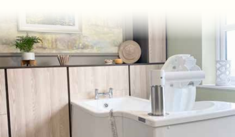
Enjoy a relaxing bath in one of our tastefully decorated bathrooms.

Lime Trees will meet all your day to day needs, including meals and snacks as well as a full laundry and housekeeping service.