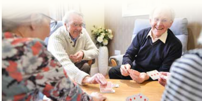
Keep active with armchair exercises, show your creative side making bird boxes or have a giggle with friends over afternoon tea, there is lots to do at Launton Grange.

When you move to Launton Grange, you join a vibrant new community of likeminded people where you can socialise with ease and build new, long-lasting friendships. Our safe and comfortable visiting spaces are the perfect place to welcome and spend time with loved ones or guests.