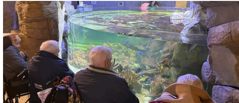
Residents enjoyed a day trip out to the Aquarium.

At Kingswood Mount Care Home, our Lifestyle team members work hard to ensure our residents individual needs are met. Uncovering and capturing individual resident hobbies and interests, as well as resident life histories, is an essential element of success in providing personalised daily activities which residents will