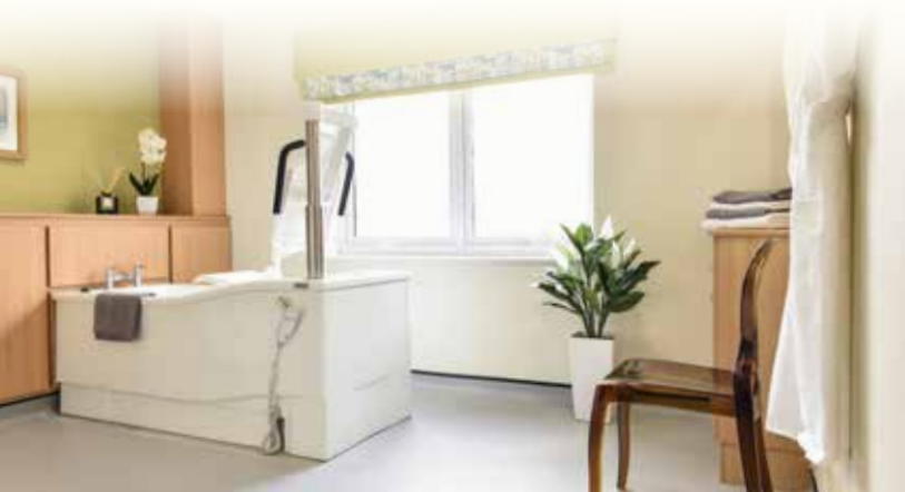
Enjoy a relaxing bath in one of our tastefully decorated bathrooms.

Herald Lodge will meet all your day to day needs, including meals and snacks as well as a full laundry and housekeeping service.