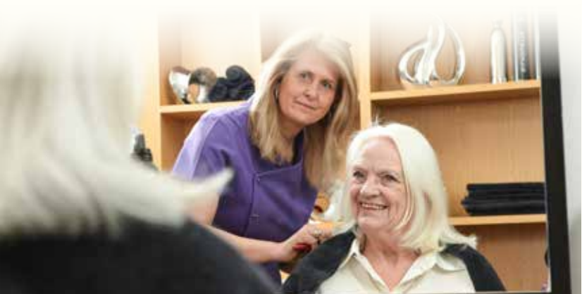
Feel pampered and looking your best at our hairdressing salon.

Your room comes fitted with everything you need but it is your home so you are very welcome to bring your own furniture as well.