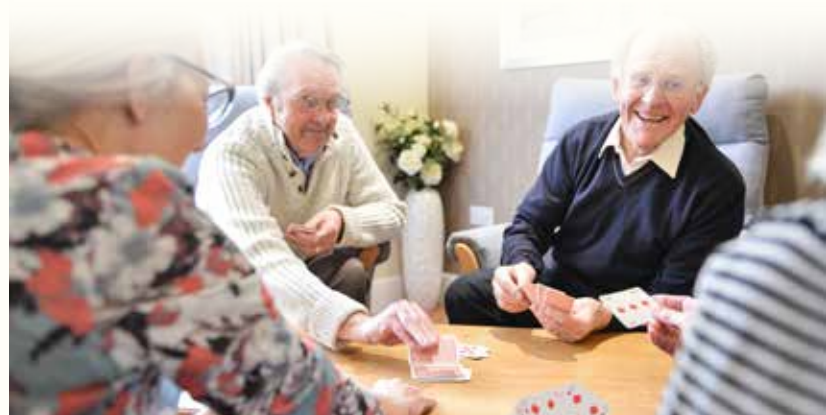
Keep active with armchair exercises, show your creative side making bird boxes or have a giggle with friends over afternoon tea, there is lots to do at Hepworth House.

When you move to Hepworth House, you join a vibrant new community of likeminded people where you can socialise with ease and build new, long-lasting friendships. Our comfortable social spaces are the perfect place to spend time with your loved ones or guests who are always welcome to visit.