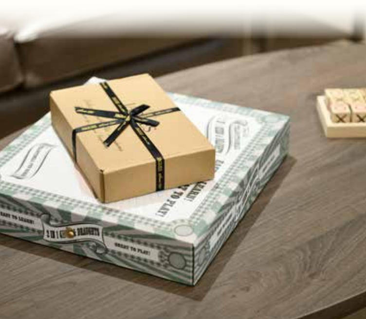
Enjoy a board game with friends.