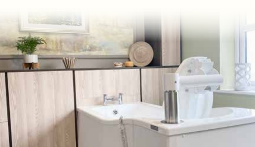
Enjoy a relaxing bath in one of our tastefully decorated bathrooms.

The design of our buildings and extensive training incorporate best practice care to make sure our residents feel calm and content. We are like one big family and our residents quickly make lasting friendships with our care team as well as fellow residents.