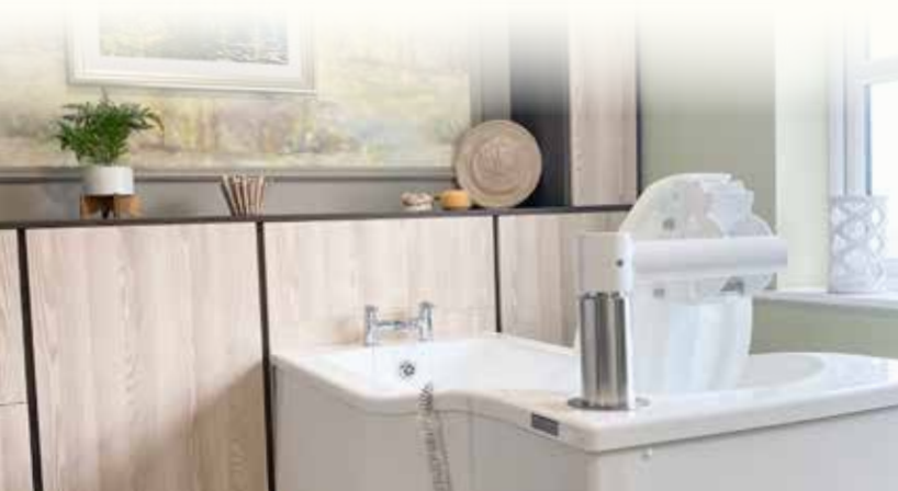
Enjoy a relaxing bath in one of our tastefully decorated bathrooms.

In addition to our high standards of infection control already in place, Ideal Carehomes has successfully launched an initiative called Ideal Fresh Living bringing a new and continued focus on cleaning and sanitisation. We have extra staff allocated to cleaning and infection control including regular deep cleans and frequent sanitising of all surfaces and this is monitored with routine audits carried out by managers. Our modern, purpose-built building provides a perfect environment to implement natural ventilation into daily life, with lots of large social areas to enjoy as well as spacious bedrooms with en-suite facilities to allow plenty of personal space for each resident.