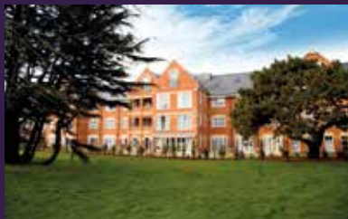
Fairmile Grange Christchurch