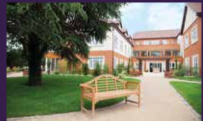
Great Oaks Bournemouth