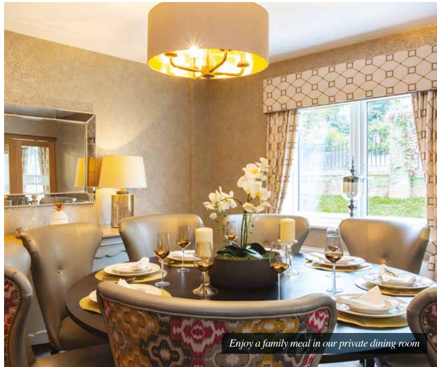
Enjoy a family meal in our private dining room