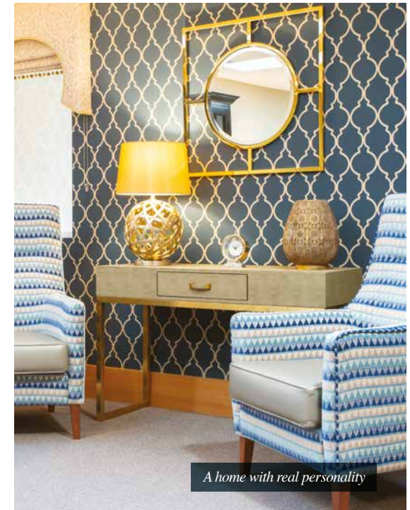
A home with real personality