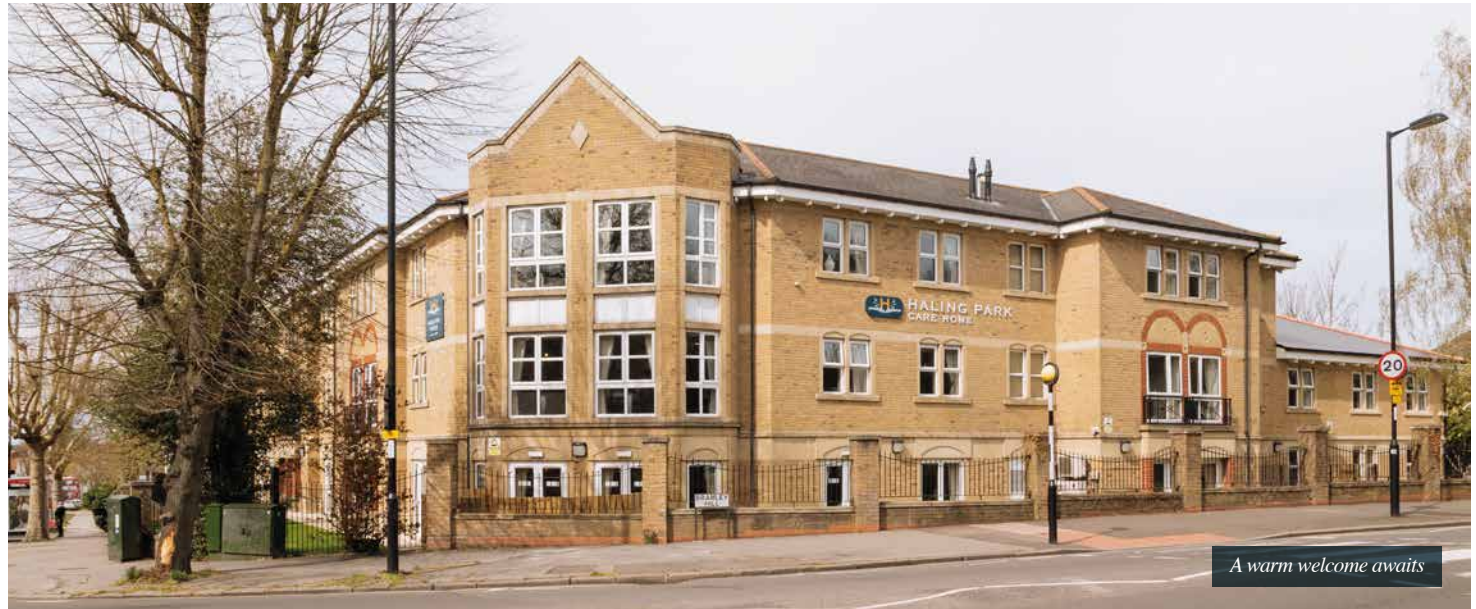
A warm welcome awaits