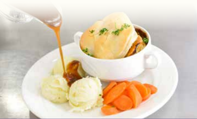
Tuck into a hearty steak pie.

Foley Grange's varied menus of healthy meals all have a choice of options at breakfast, lunch and dinner. All food in the home is created using the best locally sourced ingredients and is prepared freshly on-site, and can be enjoyed wherever you prefer - perhaps in the well-appointed dining rooms or tea room with your fellow residents or more private dining, in the comfort of your room whilst catching up with the soaps.