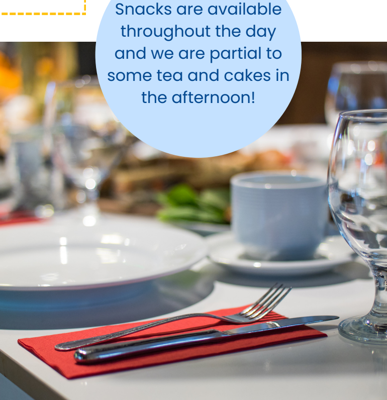
A comfortable, clean and relaxing space to enjoy your meals.