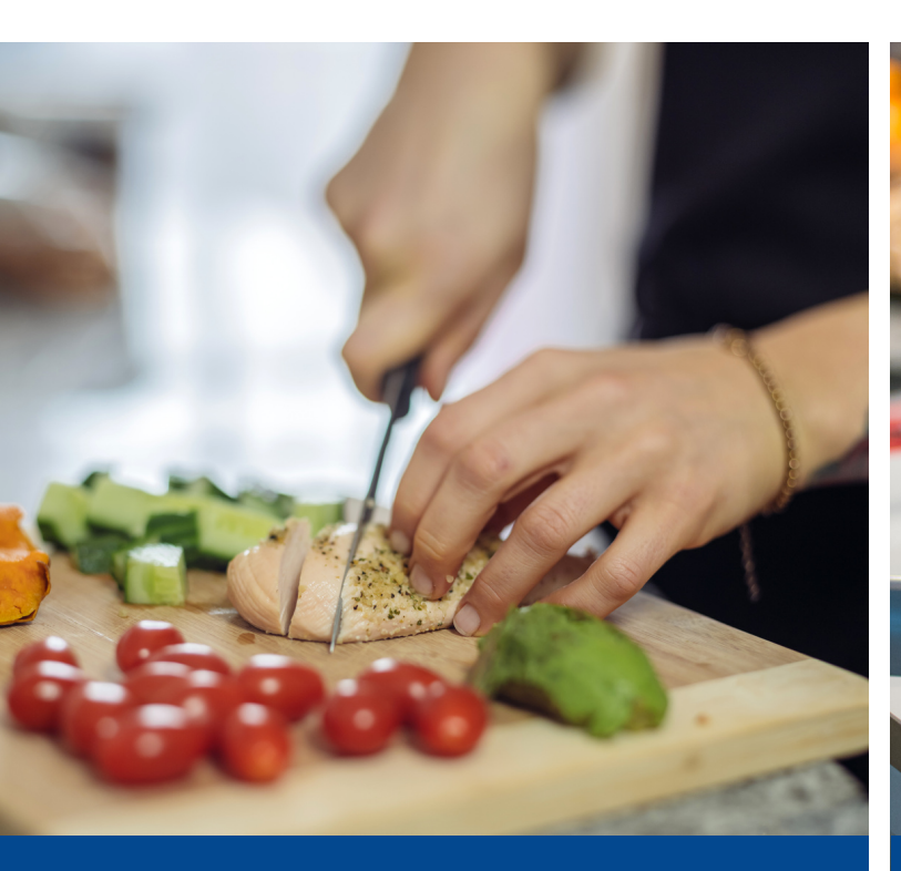
High quality, fresh food prepared for every meal.

Our Head Chef loves to speak with our residents regarding the menu that we offer and is always happy to accommodate special requests for a favourite dish.