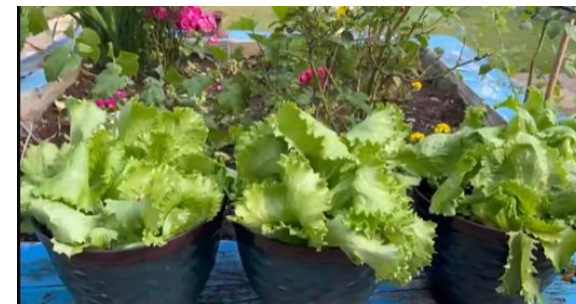
Dell Field Lettuces!