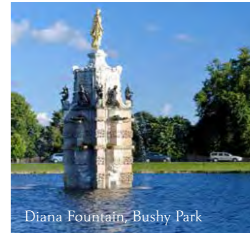
Diana Fountain, Bushy Park