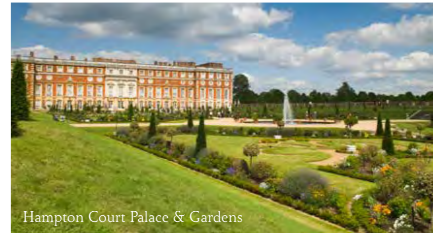
Hampton Court Palace & Gardens