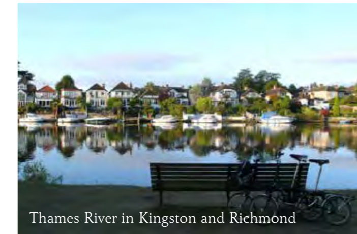
Thames River in Kingston and Richmond