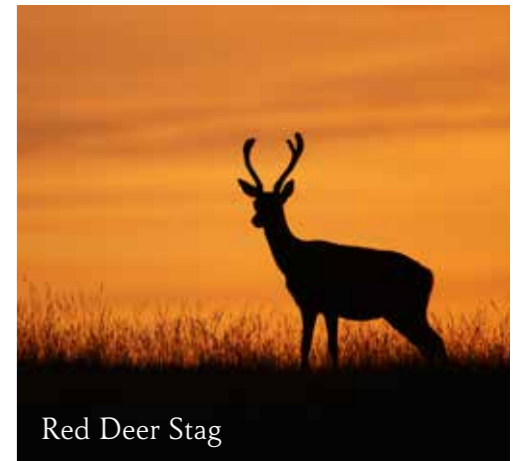
Red Deer Stag