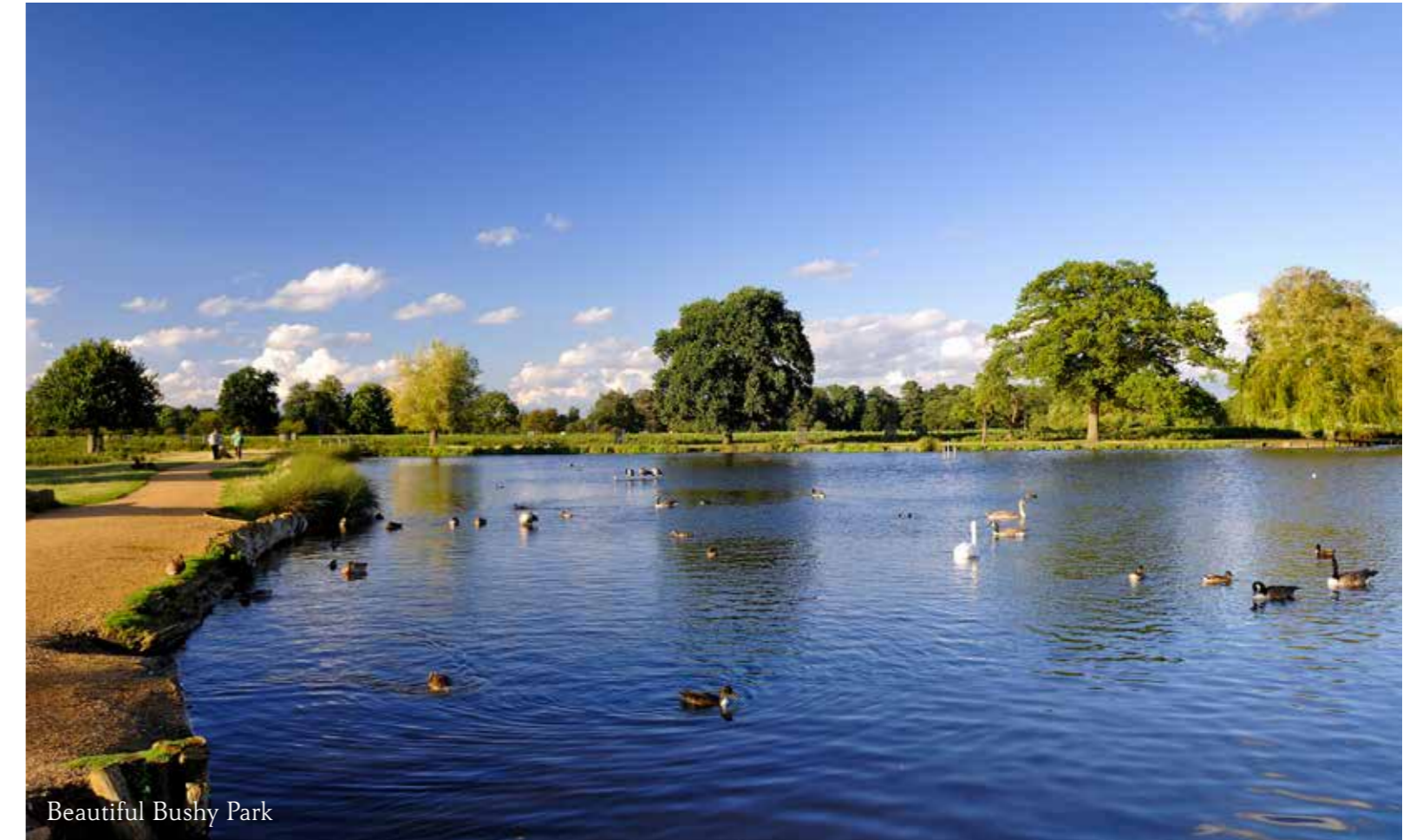
Beautiful Bushy Park