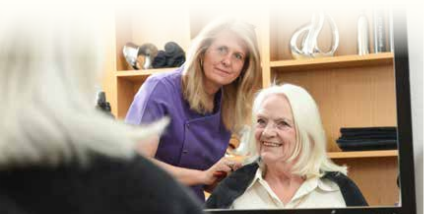
Feel pampered and looking your best at our hairdressing salon.