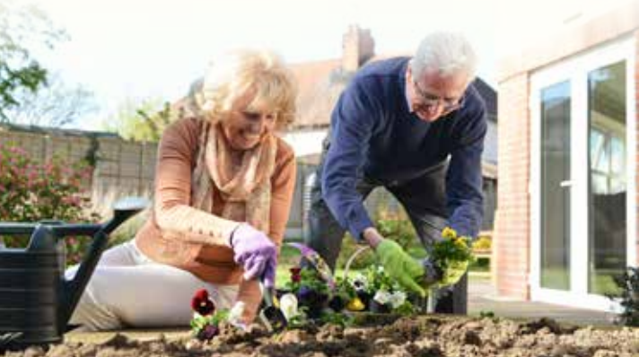
Help plant vegetables or enjoy the morning paper in the sun.