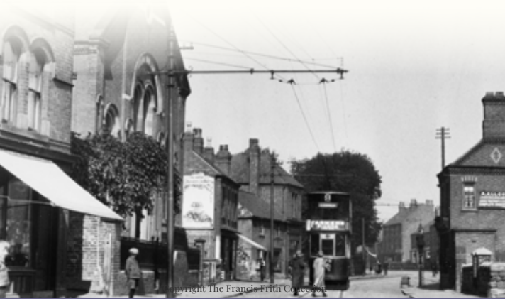
Located in the heart of the community.