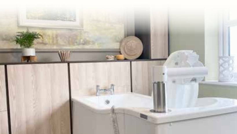
Enjoy a relaxing bath in one of our tastefully decorated bathrooms.

In addition to our high standards of infection control already in place, Ideal Carehomes has successfully launched an initiative called Ideal Fresh Living bringing a new and continued focus on cleaning and sanitisation. Our modern, purpose-built building provides a perfect environment to implement natural ventilation into daily life, with lots of large social areas to enjoy as well as spacious bedrooms with en-suite facilities to allow plenty of personal space for each resident.