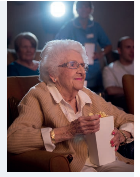
existing hobbies here. They can also suggest something they'd like to try, as a group or in their room.