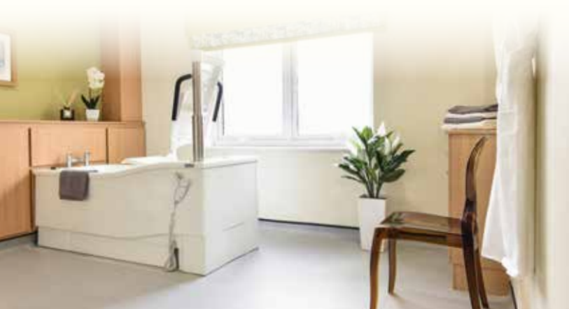
Enjoy a relaxing bath in one of our tastefully decorated bathrooms.

Brinnington Hall will meet all your day to day needs, including meals and snacks as well as a full laundry and housekeeping service.