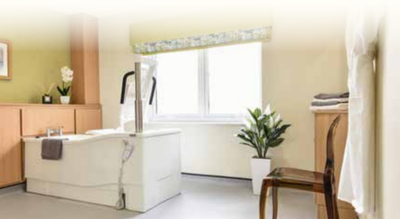
Enjoy a relaxing bath in one of our tastefully decorated bathrooms.

Bradley Hall will meet all your day to day needs, including meals and snacks as well as a full laundry and housekeeping service.