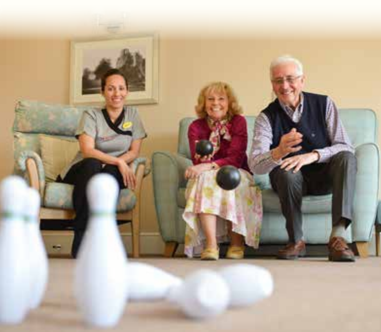
Have a game of carpet bowls with friends.

Activities encourage fullness of life, day to day enjoyment and fun. Each day, there is a full timetable of activities available in the home as well as many recreational resources you can access yourself at any time. If you want to kick-back and watch TV, that's fine too – this is your home to enjoy as many or few of the activities on offer as you wish.