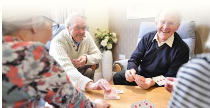
Keep active with armchair exercises, show your creative side making bird boxes or have a giggle with friends over afternoon tea, there is lots to do at Bradley Hall.

When you move to Bradley Hall, you join a vibrant community of likeminded people where you can socialise with ease and build new, long-lasting friendships. Our safe and comfortable visiting spaces are the perfect place to welcome and spend time with loved ones or guests.