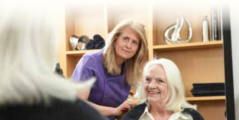
Feel pampered and looking your best at our hairdressing salon.

Your room comes fitted with everything you need but it is your home so you are very welcome to bring your own furniture as well.