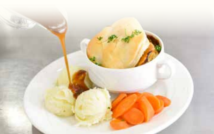
Tuck into a hearty steak pie.

Bradley Hall's varied menus of healthy meals all have a choice of options at breakfast, lunch and dinner. All food in the home is created using the best locally sourced ingredients and is prepared freshly on-site, to be enjoyed wherever you prefer - perhaps in the well-appointed dining rooms with your fellow residents or more private dining, in the comfort of your room whilst catching up with the soaps.