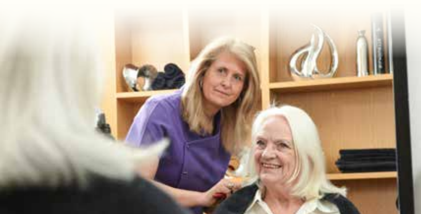
Feel pampered and looking your best at our hairdressing salon.

Your room comes fitted with everything you need but it is your home so you are very welcome to bring your own furniture as well.