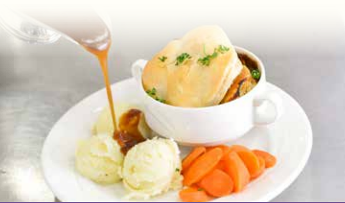
Tuck into a hearty steak pie.

Bowbridge Court's varied menus of healthy meals all have a choice of options at breakfast, lunch and dinner. All food in the home is created using the best locally sourced ingredients and is prepared freshly on-site, to be enjoyed wherever you prefer - perhaps in the well-appointed dining rooms with your fellow residents or more private dining, in the comfort of your room whilst catching up with the soaps.