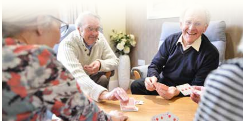
Keep active with armchair exercises, show your creative side making bird boxes or have a giggle with friends over afternoon tea, there is lots to do at Bowbridge Court.

When you move to Bowbridge Court you join a vibrant community of likeminded people where you can socialise with ease and build new, long-lasting friendships. Our safe and comfortable visiting spaces are the perfect place to welcome and spend time with loved ones or guests.