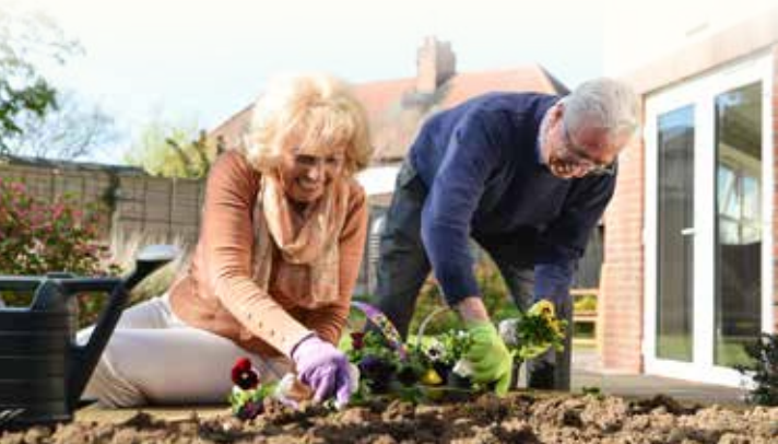
Help plant vegetables or enjoy the morning paper in the sun.

Bowbridge Court has all the finishing touches you would expect from a warm and welcoming home, with cosy fire places, attractive décor and freely accessible, secure, gardens. All 54 bedrooms are en-suite, enabling us to deliver person-centred care in a dignified manner, promoting independence as far as possible.