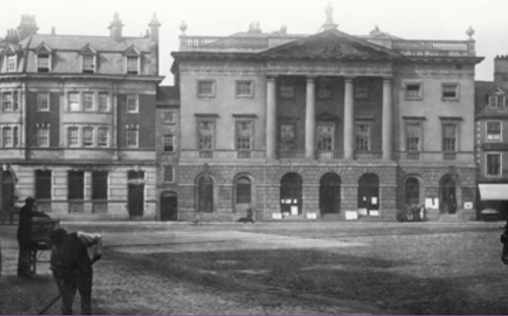
Located in the heart of the community.