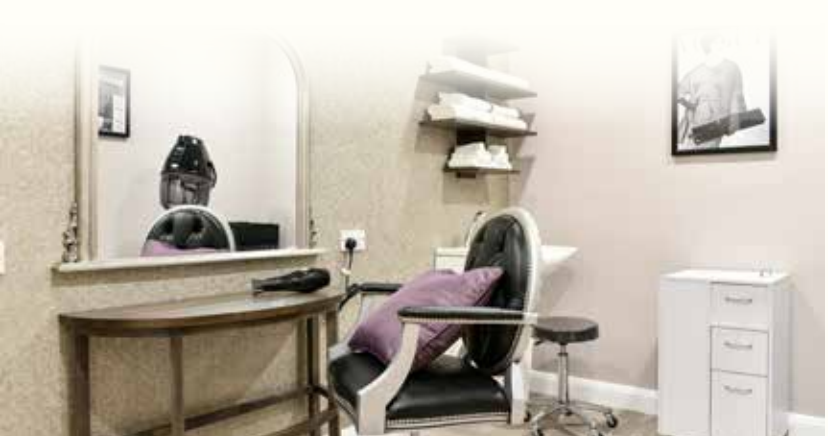
Feel pampered and looking your best at our hairdressing salon.

Your room comes fitted with everything you need but it is your home so you are very welcome to bring your own furniture as well.