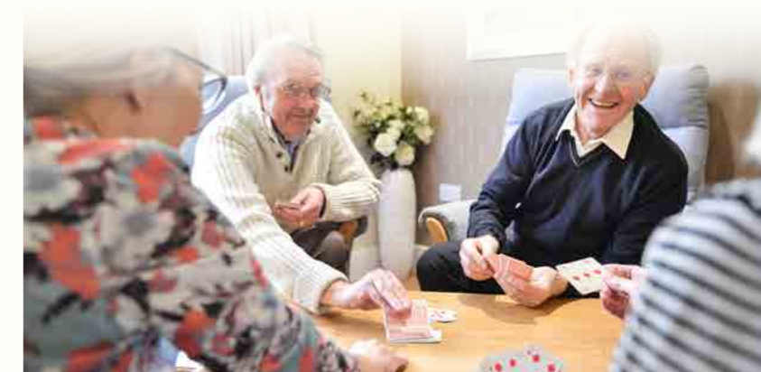
Keep active with armchair exercises, show your creative side making bird boxes or have a giggle with friends over afternoon tea, there is lots to do at Ashworth Grange.

Ashworth Grange is an important part of the local community in Dewsbury and we often have visitors to the home to deliver talks, perform or join us for a coffee morning.