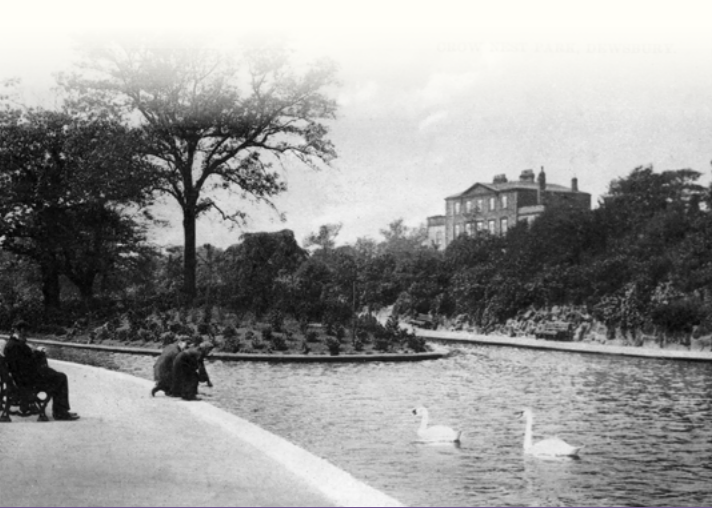
Located in the heart of the community.