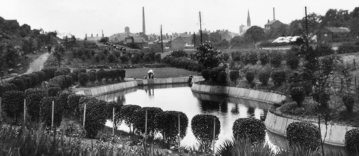
Located in the heart of the community.