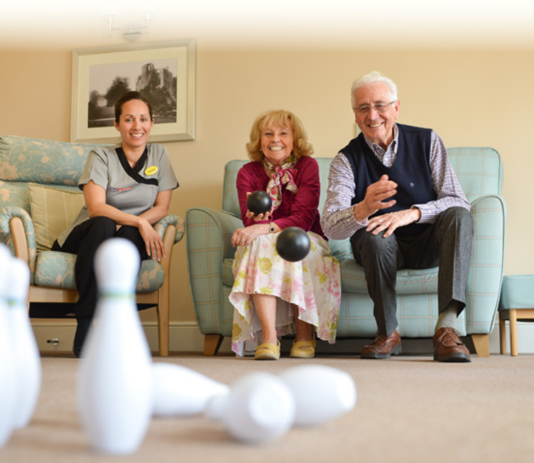
Have a game of carpet bowls with friends.

Ash Tree House's Lifestyle Manager makes sure we have a variety of entertainment and pursuits for you to take part in. We regularly have a larger themed party or event, whether Christmas, Valentine's Day or a garden party. Friends and family are invited to join in.