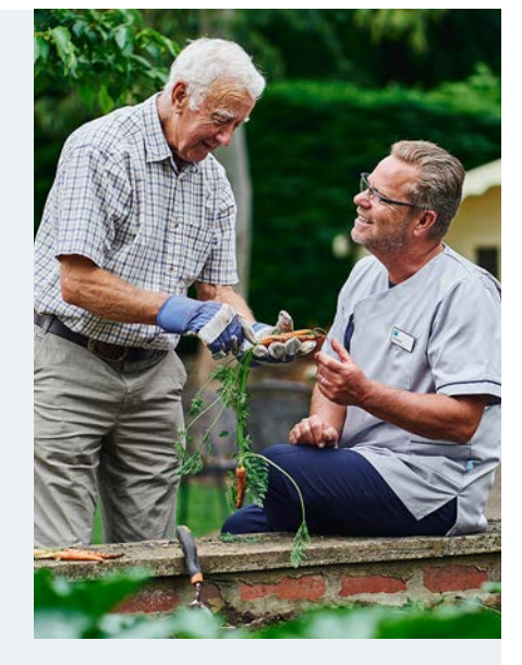
Residents can continue to enjoy most of their existing hobbies at Ashley House. And they can always suggest something they'd like to try, as a group activity or by themselves.