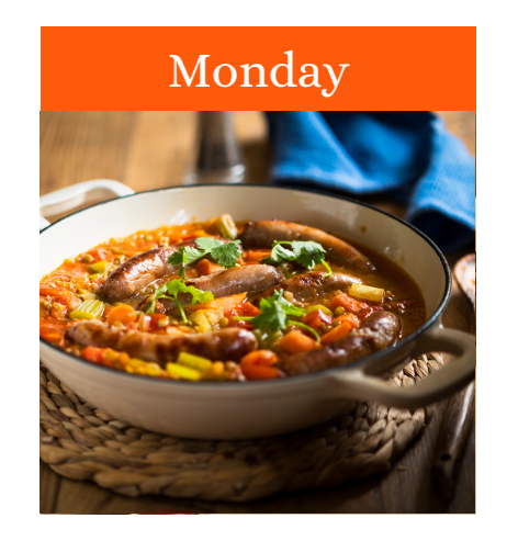
SAUSAGE & BACON CASSEROLE OR