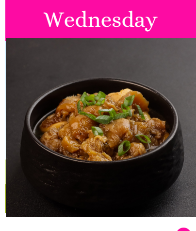
CHICKEN CHASSUER OR