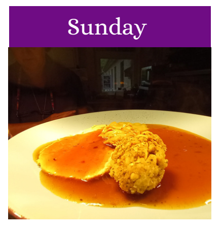
ROAST TURKEY OR