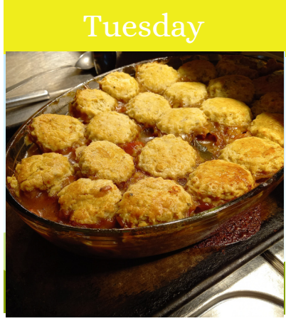
LAMB COBBLER OR