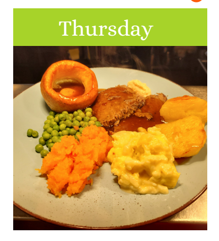
ROAST BEEF & YORKSHIRE PUDDING OR