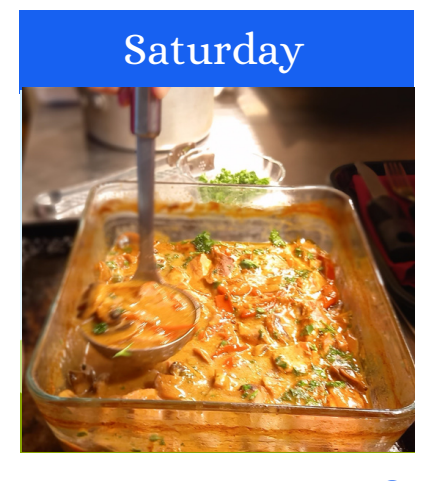
PORK & MUSHROOM STROGANOFF OR