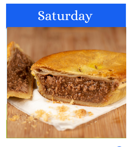
MINCE BEEF & ONION PIE OR

If you do not want the Main Menu option we have an alternative. The choices are: