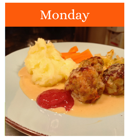
SWEDISH MEATBALLS IN CREAMY SAUCE OR