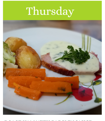
ROAST HAM WITH PARSLEY SAUCE OR