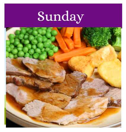
ROAST LAMB OR