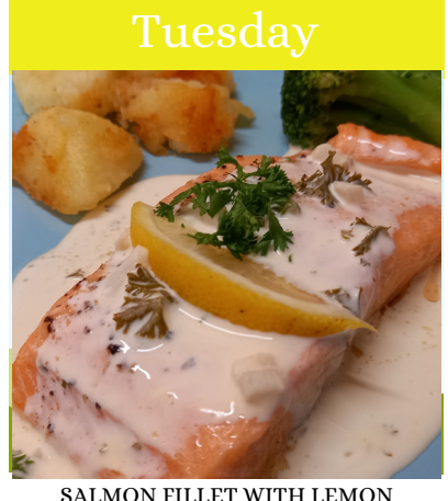
SALMON FILLET WITH LEMON BUTTER SAUCE OR