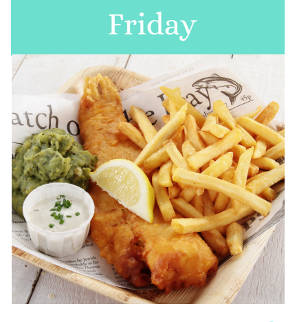
FISH & CHIPS OR