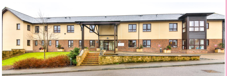
St Clare's and one of the views across the grounds