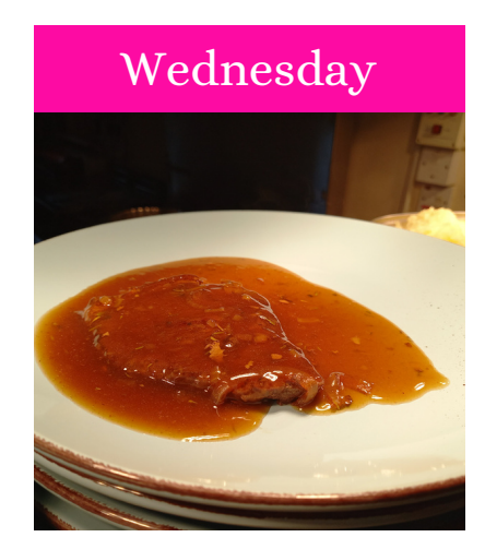
BRAISED STEAK & ONIONS