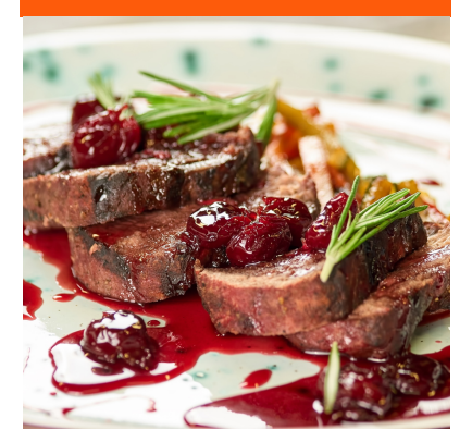
SWEDISH MEATBALLS IN